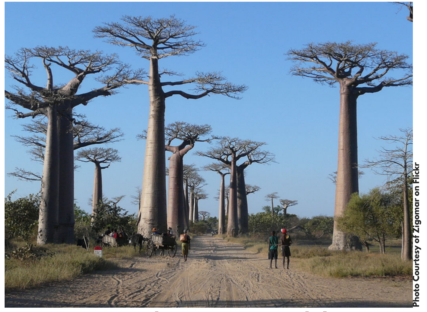
Make sure you stay with your group while you are visiting the trees!

These people are walking along the avenue. They are being careful and keeping an eye out for cars, carts and even wild animals!