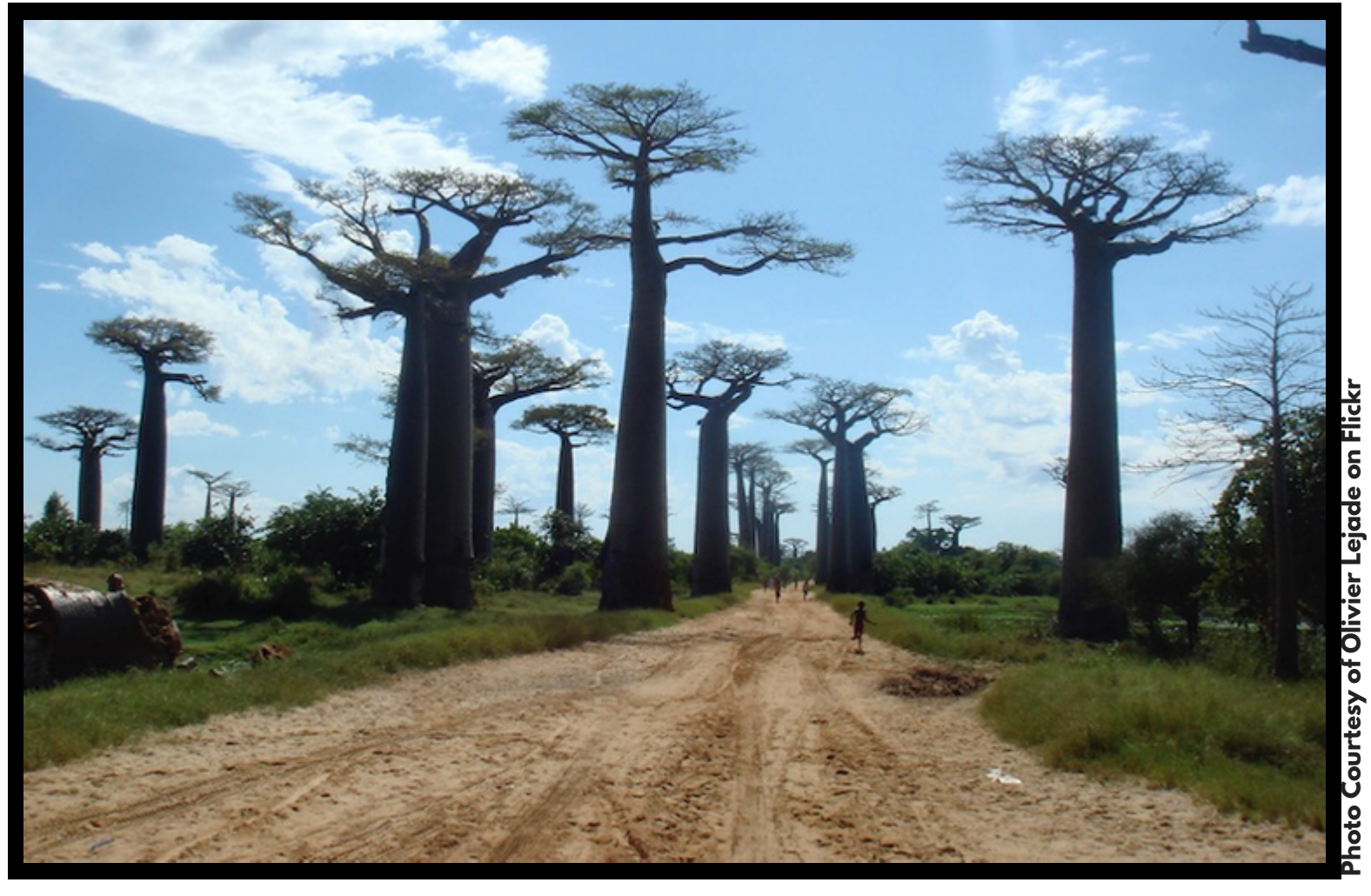
I Am Going To The Avenue of the Baobabs! A Step-by-Step Guide On How To Visit These Amazing Trees.