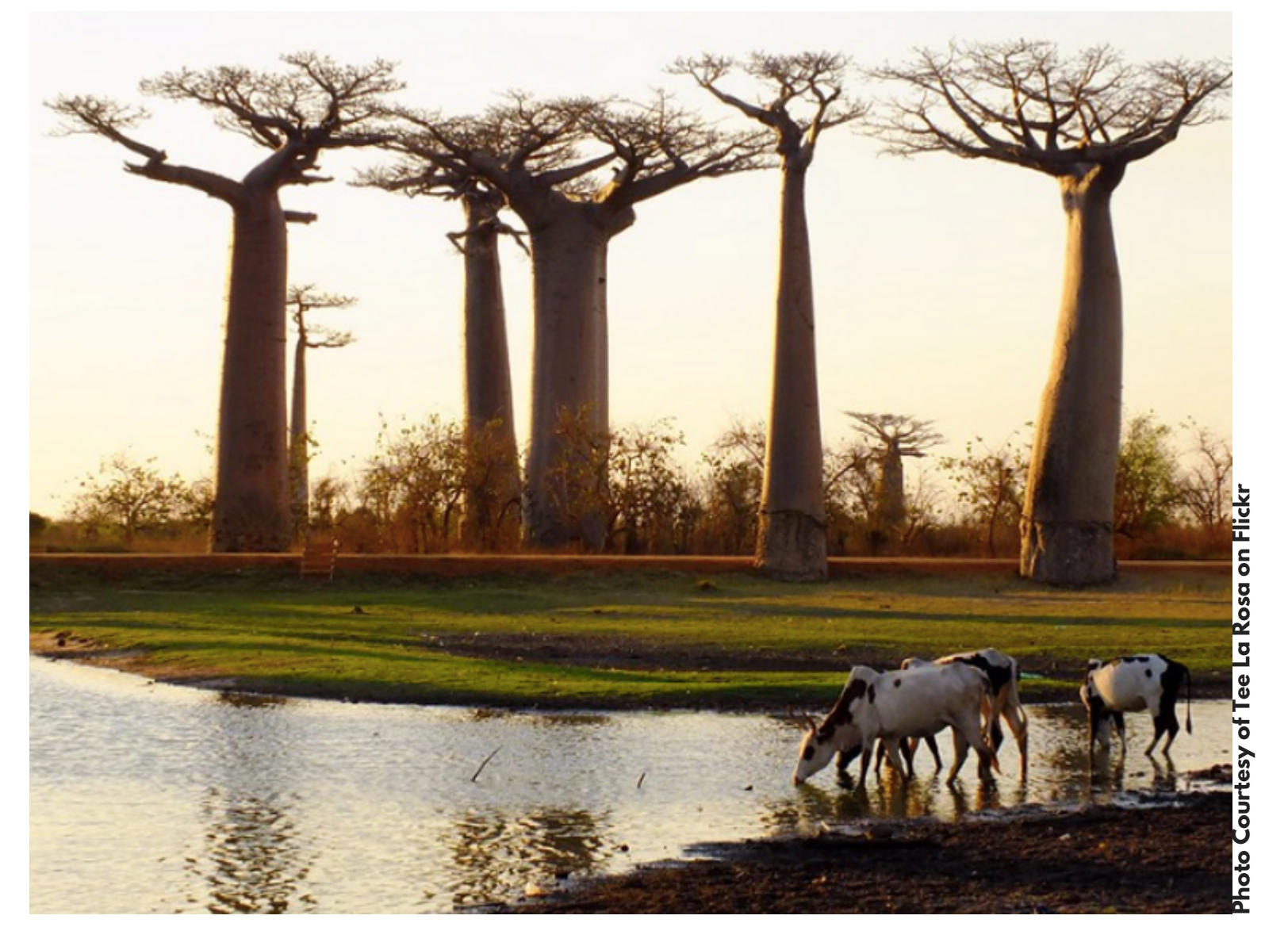
I hope you have a great time visiting these amazing trees!