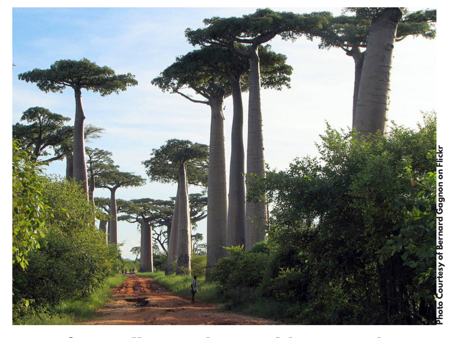
People come from all over the world to visit these amazing trees. Let's go see the baobab trees!