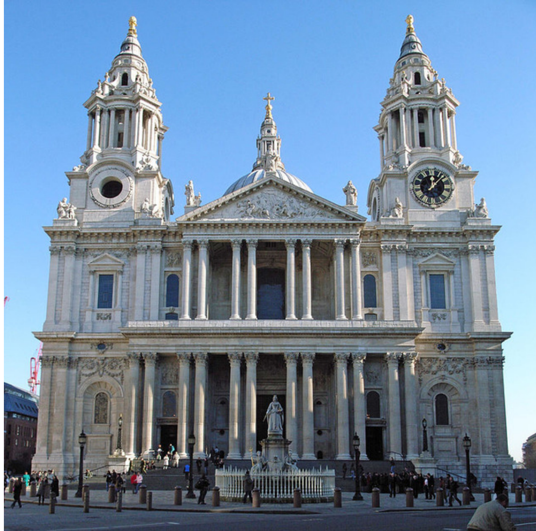
West Entrance, St Paul's Cathedral

This is the West Front entrance of St Paul's Cathedral. The doors to go inside are at the top of the stairs.