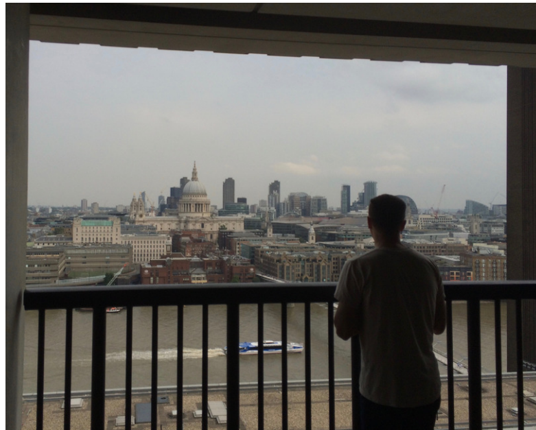
St Paul's Cathedral from the Tate Viewing Platform.

Tate Modern is just a short walk across the Thames on the Millennial Bridge. One really wonderful outing is to go up to the Tate Viewing Platform and look at St Paul's from across the river, then cross the bridge and walk around St. Paul's. This gives you a chance to see the Cathedral from afar and then from up close.